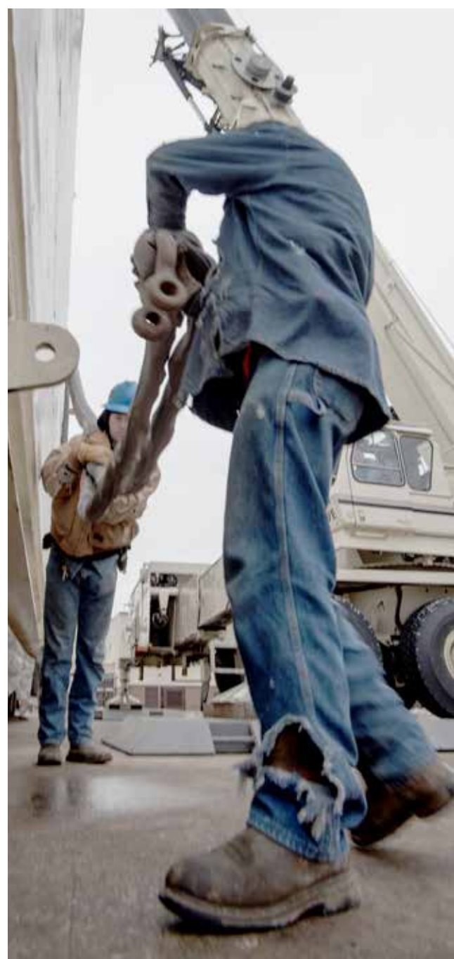
Contractors prepare the special access program facility (SAPF) to be moved onto the flight line Dec. 6, 2018, at Whiteman Air Force Base, Mo. The addition of the SAPF looks to save the 509th Maintenance Group roughly 30 man hours a week with its quicker processing capabilities and more centralized location on the flight line.

Consolidating all of these components into the new SAPF facility will save the 509th MXG roughly 30 man-hours a week and will assure that B-2 repairs are made swiftly and more accurately than ever before.