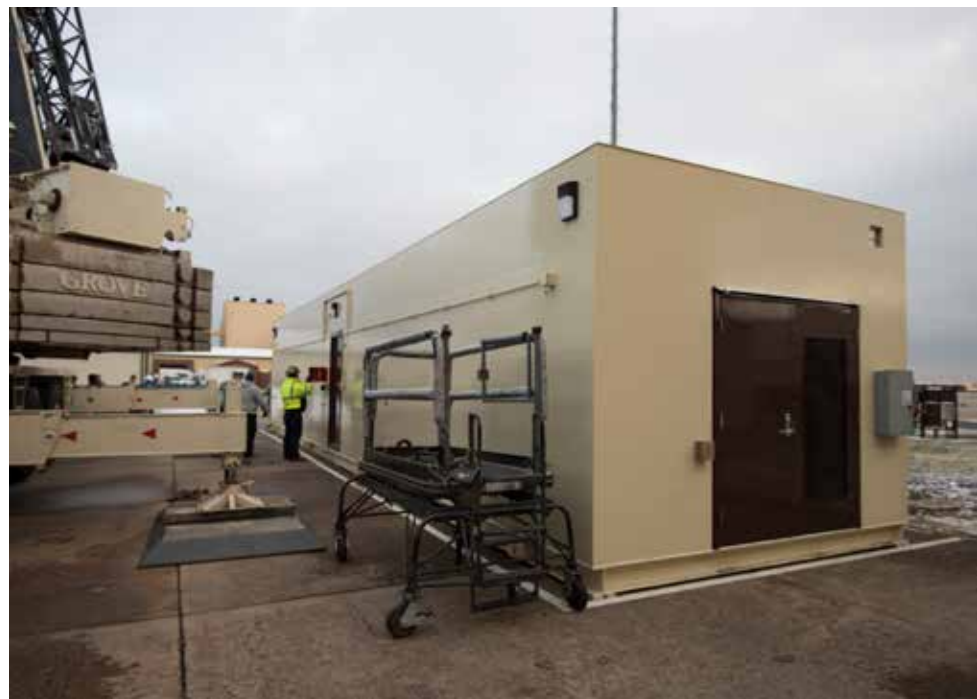
Contractors successfully deliver the new special access program facility (SAPF) Dec. 6, 2018, at Whiteman Air Force Base, Missouri. The SAPF allows the 509th Maintenance Group to detect defects in its radar cross section characteristics. Fixing these defects is essential to the B-2 Spirit Bomber's stealth abilities.