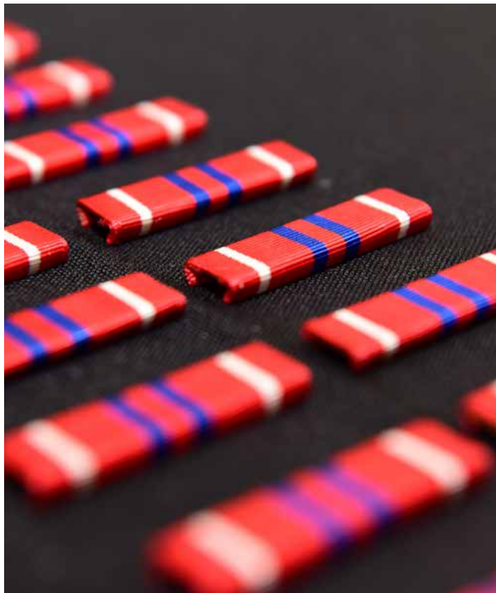
Rows of Airman Leadership School ribbons lay on a table during an ALS graduation ceremony on Dec. 6, 2018 at Whiteman Air Force Base, Mo. More than 40 senior airmen from across the base completed the 24-day course.