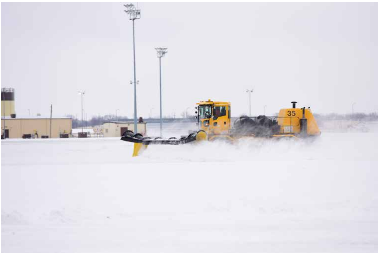
A plow moves snow during the 2017 winter season on Whiteman Air Force Base, Mo.